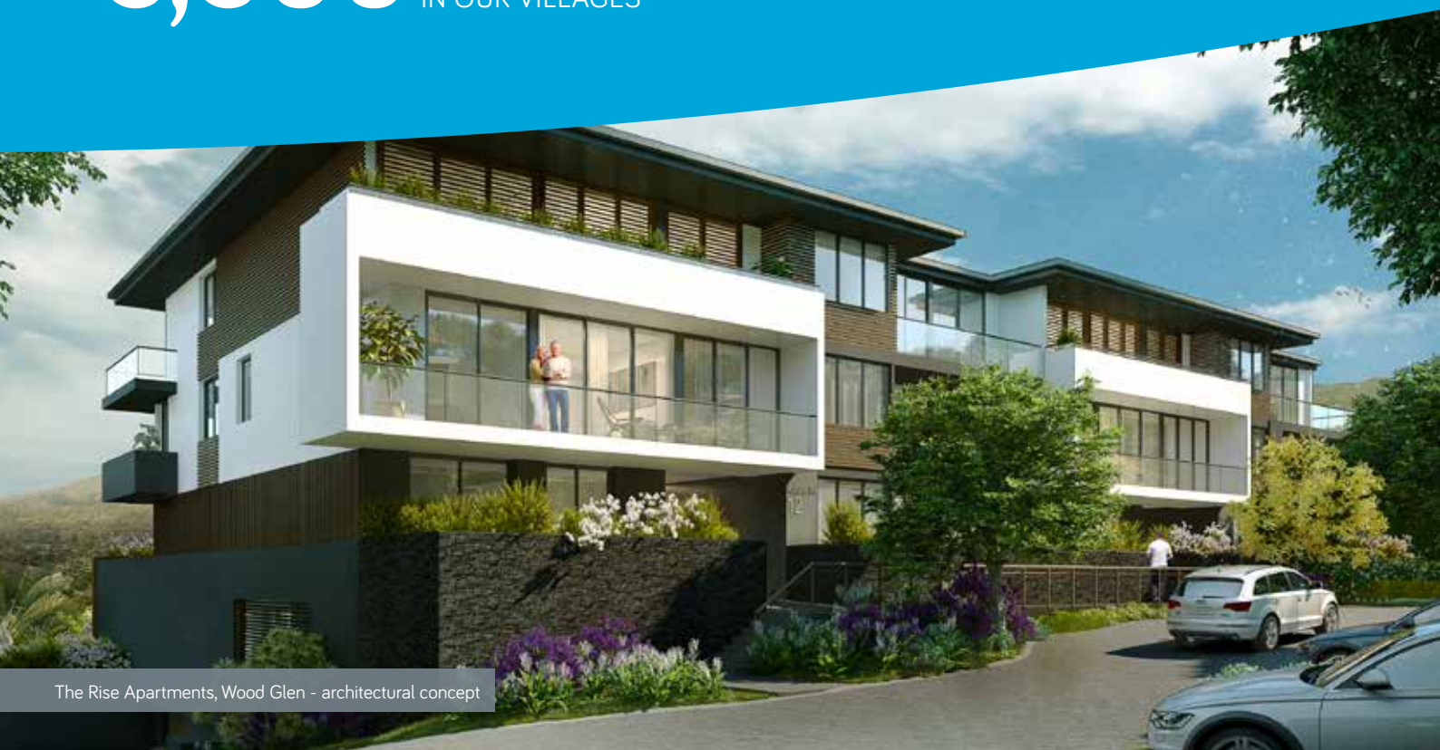
The Rise Apartments, Wood Glen - architectural concept