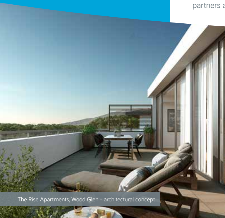
The Rise Apartments, Wood Glen - architectural concept

Our ultimate goal is to create integrated communities with ongoing interaction between our residents, their family and networks, our partners and the surrounding community.